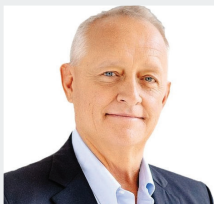
Justice Joe Deters