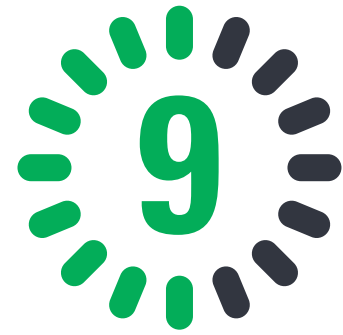
AVERAGE # OF EMPLOYEES

NFIB membership is open to all independent businesses, excluding not-for-profit and publicly held companies. NFIB's approximately 300,000 members span the spectrum of business operations, ranging from one-person cottage enterprises to firms with hundreds of employees.