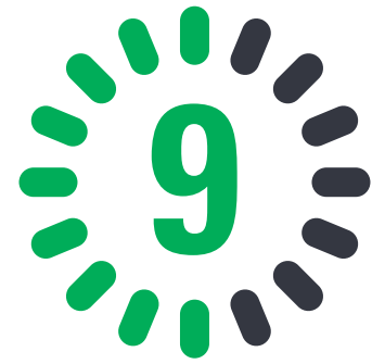
AVERAGE # OF EMPLOYEES

NFIB membership is open to all independent businesses, excluding not-for-profit and publicly held companies. NFIB's approximately 300,000 members span the spectrum of business operations, ranging from one-person cottage enterprises to firms with hundreds of employees.